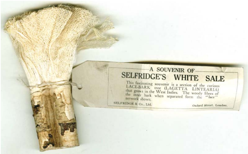
FIG. 5. Branch showing lace production technique; sold at Selfridge's department store, London, c. 1920–1930.