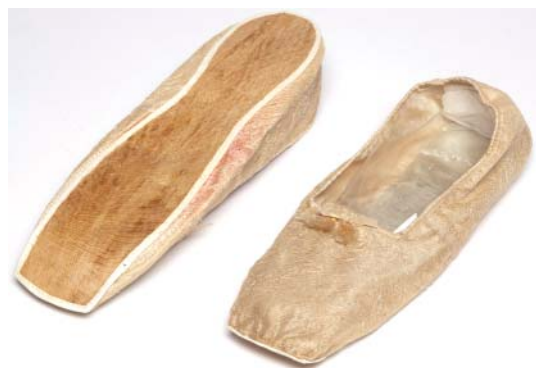
FIG. 7. A pair of lace-bark slippers, c. 1827. The lace-bark is overlaid on silk and the soles of the slippers are made of coconut bark. They appear never to have been worn. Length: 28 cm.

(EBC 67770).