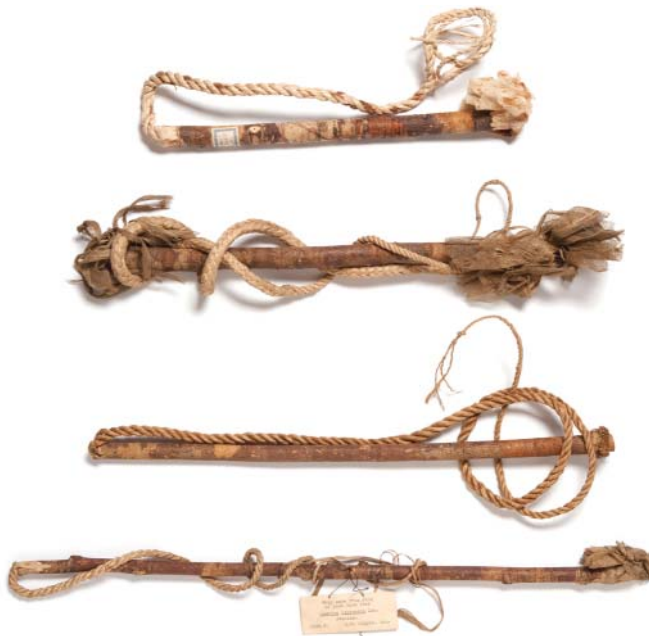
FIG. 3. Lace-bark whips made from branches of the lace-bark tree. The inner woody portion and outer bark have been partially removed and the remaining inner bark twisted into the whip tails. Length of handle, reading from top to bottom: EBC 75996 36 cm; EBC 44946(1) 43 cm; EBC 44946(2) 49 cm; EBC 44956 60 cm.