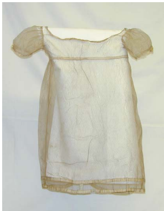
FIG. 9. Lace-bark dress, donated in 1833 by Marchioness Cornwallis. Saffron Walden Museum, Essex (no. 1833.59). Photograph: © Saffron Walden Museum, Essex (Image No. 000491).

refer to the decline of lace-bark production, noting in 1960, ‘men have to go out into the forest and stay there for a few days at least’; 67 in 1968 ‘in these modern days men no longer want to strip the tree which produces the lace’ 68 and also in 1968 ‘it might be termed a laborious job for men’. 69