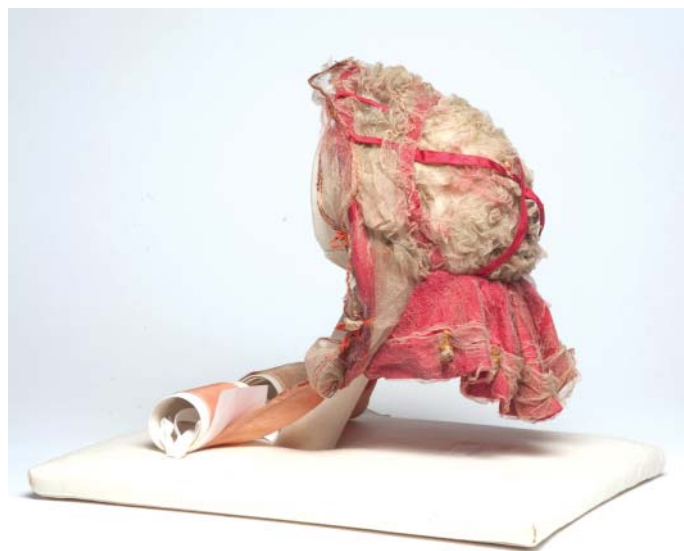
FIG. 1. Lace-bark bonnet, after conservation on a custom-made mount. The bonnet is made of an array of materials including metal, cotton, silk, seeds, moss and strips of raw plant fibre. The lace-bark is overlaid, ruched and decorated with stitching. Height (excluding ribbons): 27 cm.

Photograph: © Royal Botanic Gardens, Kew (EBC 44939).